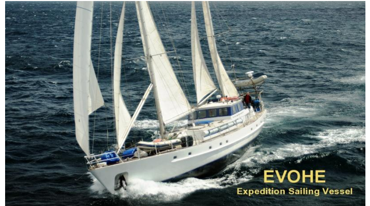
Figure 3 - Evohe from Dunedin, New Zealand