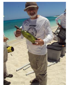
Figure 10 - Pista HA5AO with the bottle

The bottle was dropped in the ocean on March 30, 2014 (18 months before) from the cruise ship "Carnival Spirit" by a family from Australia. The ship was traveling from Noumea to Sydney. We sent an e-mail to the family from the