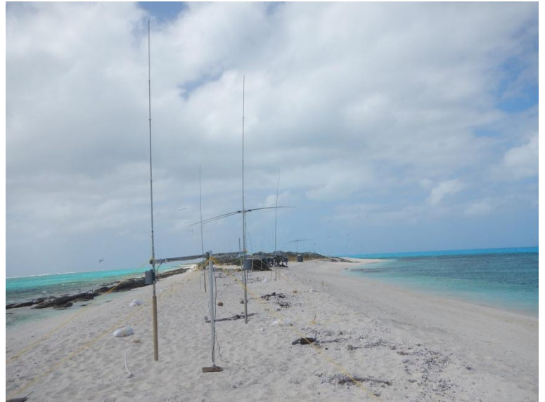
Figure 7 - Note width of the sandbar at low tide

As the days progressed the wind never subsided and propagation was getting worse. In spite of the dangerous conditions we did get the SteppIR beams erected. On day 5 the 80 meter antenna was raised. Due to the fierce wind, we couldn't get the 18M Spiderpole up for the 80M vertical but we jury rigged a 30 foot antenna mast with a top loading wire in an inverted L configuration. We tried installing the Battle Creek Special, but the winds were too strong. Towards the end of the project the 80M antenna was reconfigured with a longer piece of wire as a makeshift 160 antenna which we used on the last night.