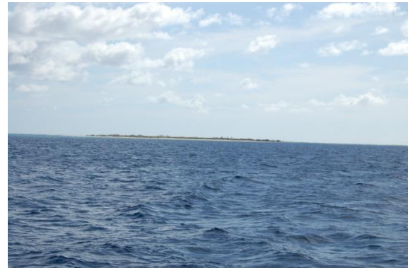
Figure 5 - First sighting of Chesterfield

Other than the first night when the wind caused some antenna problems we had no other wind related antenna problems except an inability to erect tall antennas. The area was a narrow sandbar, about thirty feet (ten meters) wide, with the sea on both sides. Salt and sand spray was constant, requiring daily maintenance of the lower antennas. The two element rotatable vertical antennas were installed first, giving us 10 – 40m capability. It was too windy (unsafe) to install the SteppIR beams, the Battle Creek Special or the 80 meter antenna.