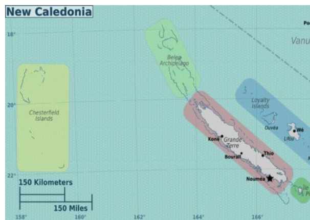
Figure 1 - The Coral Sea – Chesterfield Islands

There are numerous cays occurring amongst the reefs of both the Chesterfield and Bampton Reefs. These include: Loop Islet, Renard Cay, Skeleton Cay, Bennett Island, Passage Islet, Long Island, the Avon Isles, the Anchorage Islets and Bampton Island.