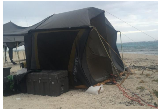
Figure 6 Typical sandbag usage